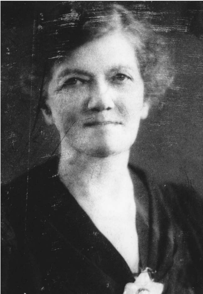
Anne Carroll Moore.