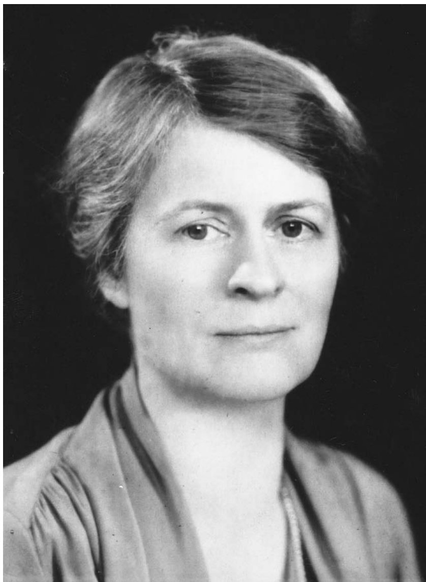
May Massee.